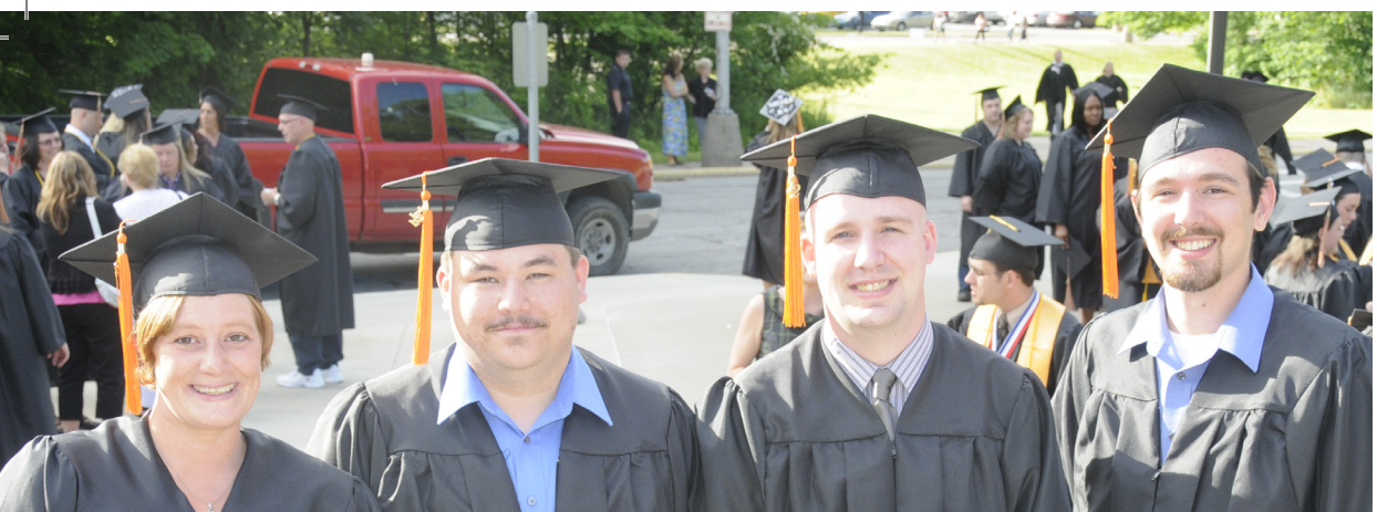
These four 2012 graduates from the Engineering Technology division were all employed before graduation by some of the most progressive manufacturing companies in the region.