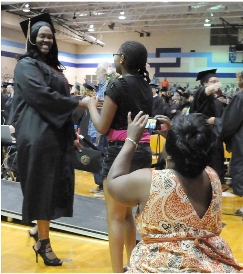
Thousands celebrated with the graduating class of 2012 on June 8th.